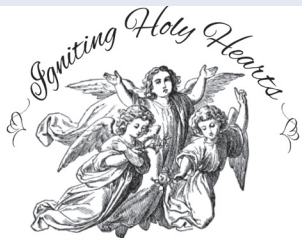
+ Angels Books & Gifts +